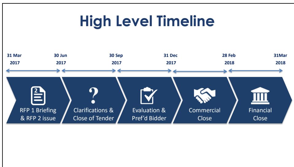
Figure 2: High Level Additional Rolling Stock Project Timeline

The draft high-level Additional Rolling Stock Project program is outlined in Figure 2.