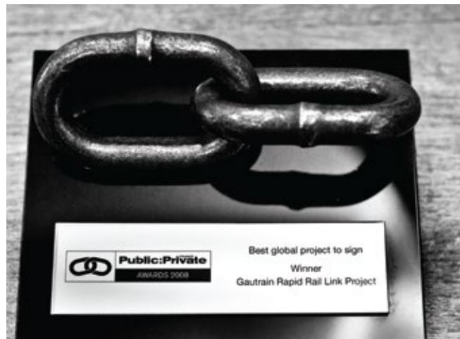
PUBLIC PRIVATE PARTNERSHIP (PPP) INDUSTRY: GLOBAL AWARD (2008)

This award for the Best Global Project was received at the tenth annual Public Private Finance Awards held on 29 April 2008 in London.