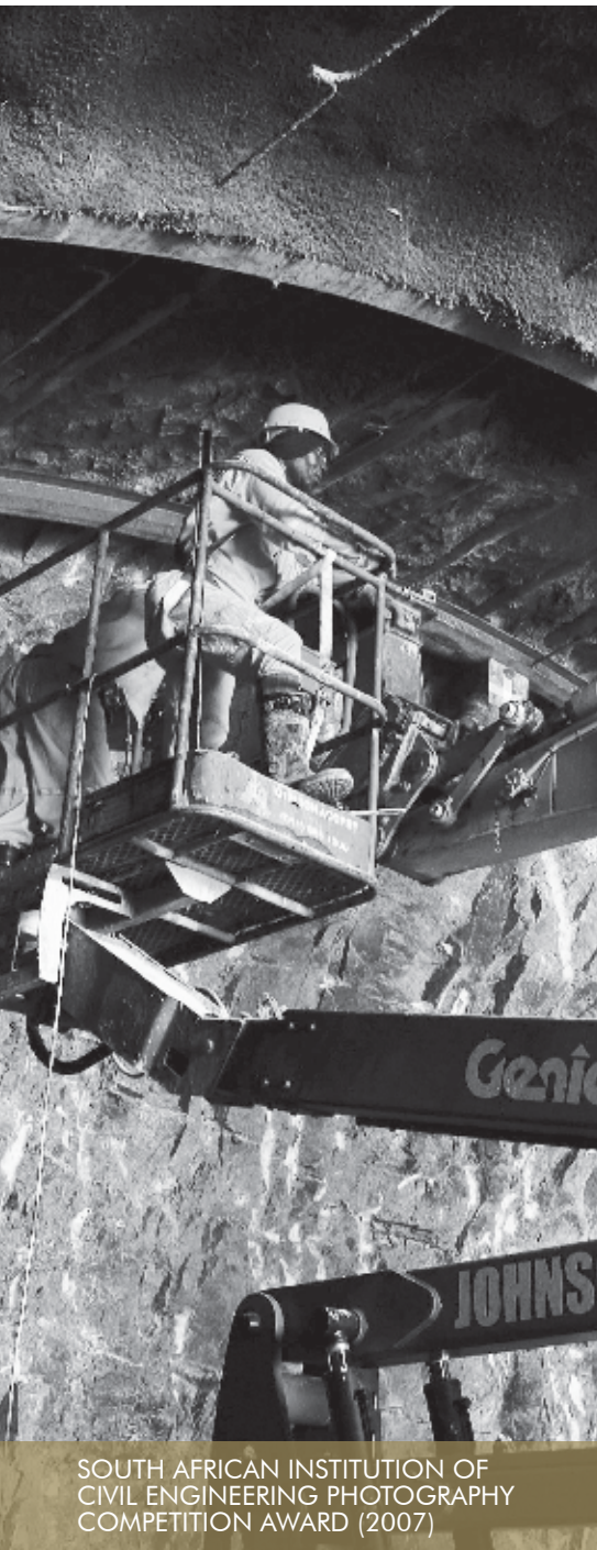
SOUTH AFRICAN INSTITUTION OF CIVIL ENGINEERING PHOTOGRAPHY COMPETITION AWARD (2007)

This case study details awards received by the Gautrain Management Agency (GMA) project, as well as by Gautrain project team members who have achieved excellence in their respective fields since the inception and launch of the project, as well as in subsequent years. These awards highlight the depth of skills and achievements throughout the duration of this greenfield project, from photography and engineering to communications and environmental initiatives.