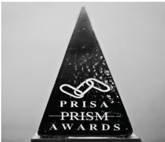
PUBLIC RELATIONS INSTITUTE SOUTH AFRICA PRISM GOLD AWARDS (2008)

This agreement was not primarily about money; it was also about innovation, risk management and economic development.