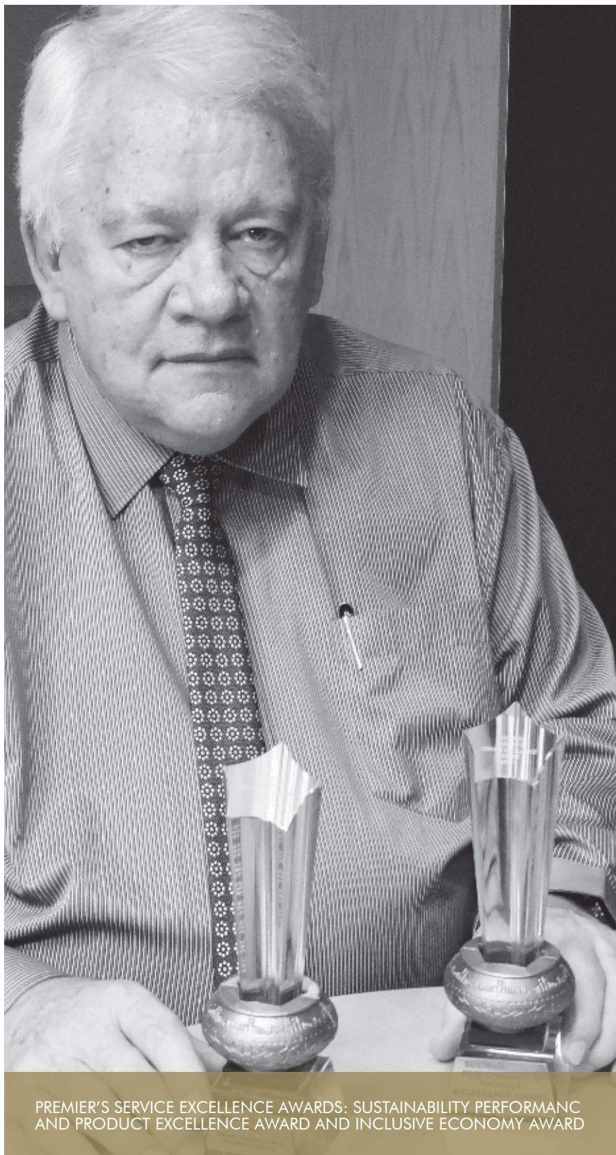
PREMIER'S SERVICE EXCELLENCE AWARDS: SUSTAINABILITY PERFORMANCE AND PRODUCT EXCELLENCE AWARD AND INCLUSIVE ECONOMY AWARD

Gautrain was also the third place winner of the Sustainability Performance and Product Excellence section under the Clean Governance Category. GMA has received unqualified and clean audits for the past four years, after courageous leadership where the Board took remedial action of putting internal controls in place, empowering the internal assurance team and management committee to take accountability in order to promote operational excellence and an ethical climate.